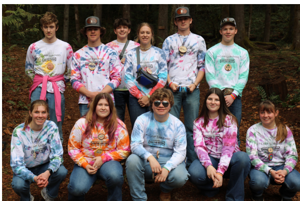
4-H Camp Tumbleweed 2023 Counselors

Is your club interested in community service during the winter season? If so, consider hosting a club canned food drive for the Crook County Holiday Partnership! We have a collection barrel at the Extension Office for clubs to drop off collected donations. Some of the most needed items are: macaroni and cheese, pasta, pasta sauce, canned fruit, veggies, fish and meat canned soup, chili, stew, peanut butter, jam, juice boxes, cereal, oatmeal and kid-friendly nutritional snacks. For more information check out the Holiday Partnership webpage . Donations due 12/15.