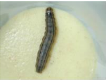
True Armyworm larva