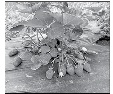
Strawberry season extension trial at NWREC. From left to right strawberries grown in a high tunnel, low tunnel, Day-neutral strawberries grown in season extension trial.

low tunnels can be built for a cost of $42 to $156/100-foot row, depending on the selection of materials. For more on building low tunnels, refer to OSU Extension publication EM 9333, Low Tunnels for Season Extension in Oregon: Design, Construction and Costs ( https://extension.oregonstate.edu/catalog/pub/em-9333-low-tunnels-season-extension-oregon-design-construction-costs ). High tunnels cost significantly more than low tunnels, with our 100' x 40' tunnel costing $6,872 total. This included the high tunnel frame, construction materials, 6-mil plastic, roll-up sides, and shade cloth. The cost for this system is $1,718/100-foot row, though the tunnel could easily accommodate an additional two rows or more in a commercial setting, bringing down the cost per 100-foot row to $1,145 or less.