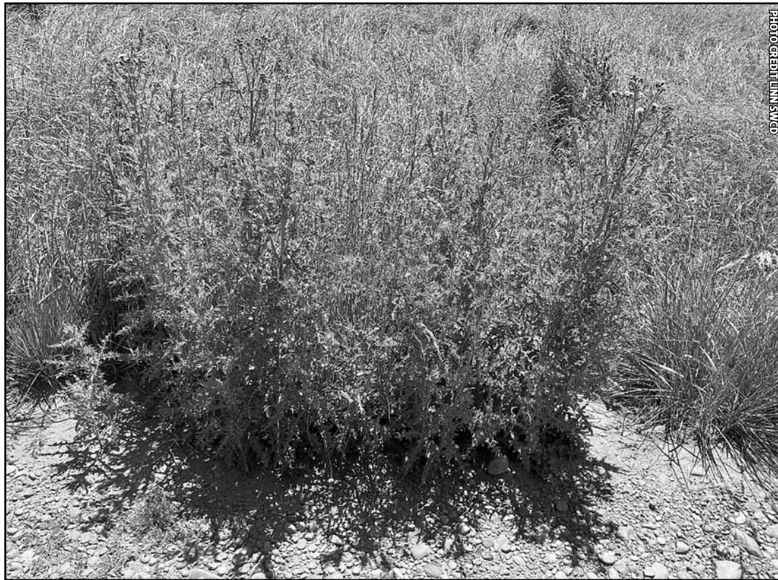
Canada thistle on a compacted field border in Linn County

Mainly weeds can show us health conditions or issues in soils. Thistles can be a bane to our pastures in Western Oregon. They are a good indicator of soil compaction though. Areas of over grazing or grazing when it's too wet can lead to patches of thistles. Some of these can be beneficial to wildlife in the form of seeds or pollen, but mainly they reduce profitability in our