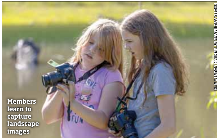
Members learn to capture landscape images

The last project that the 4-H members completed was to photograph silhouettes of their hands and the 4-H clover, forming the word "LOVE". These images were used in the creation of stickers and bumper stickers. These stickers and bumper stickers are being sold as part of a fundraiser to cover the cost of the workshop series. If you would like to support the 4-H photography members and want more information about these stickers, including how to purchase them, please see the online form here: https://beav.es/pqV