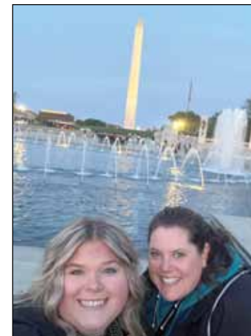
Night tour at National Monuments.

answered questions from the agency afterwards. Some of the agencies included the Juvenile Justice Department, Department of Labor, Department of Energy, and the Library Department.