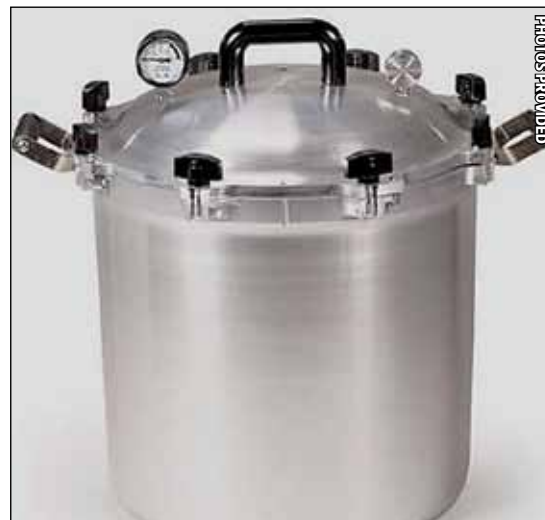
All American canners use weights to measure pressure. There is a gauge on the lid, but it acts as a guide to know when pressure is at zero after the canning process is done. This gauge does not require testing.