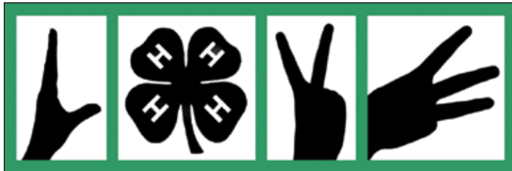
Bumper stickers created by 4-H members that are available for purchase as a fundraiser for the 4-H program.