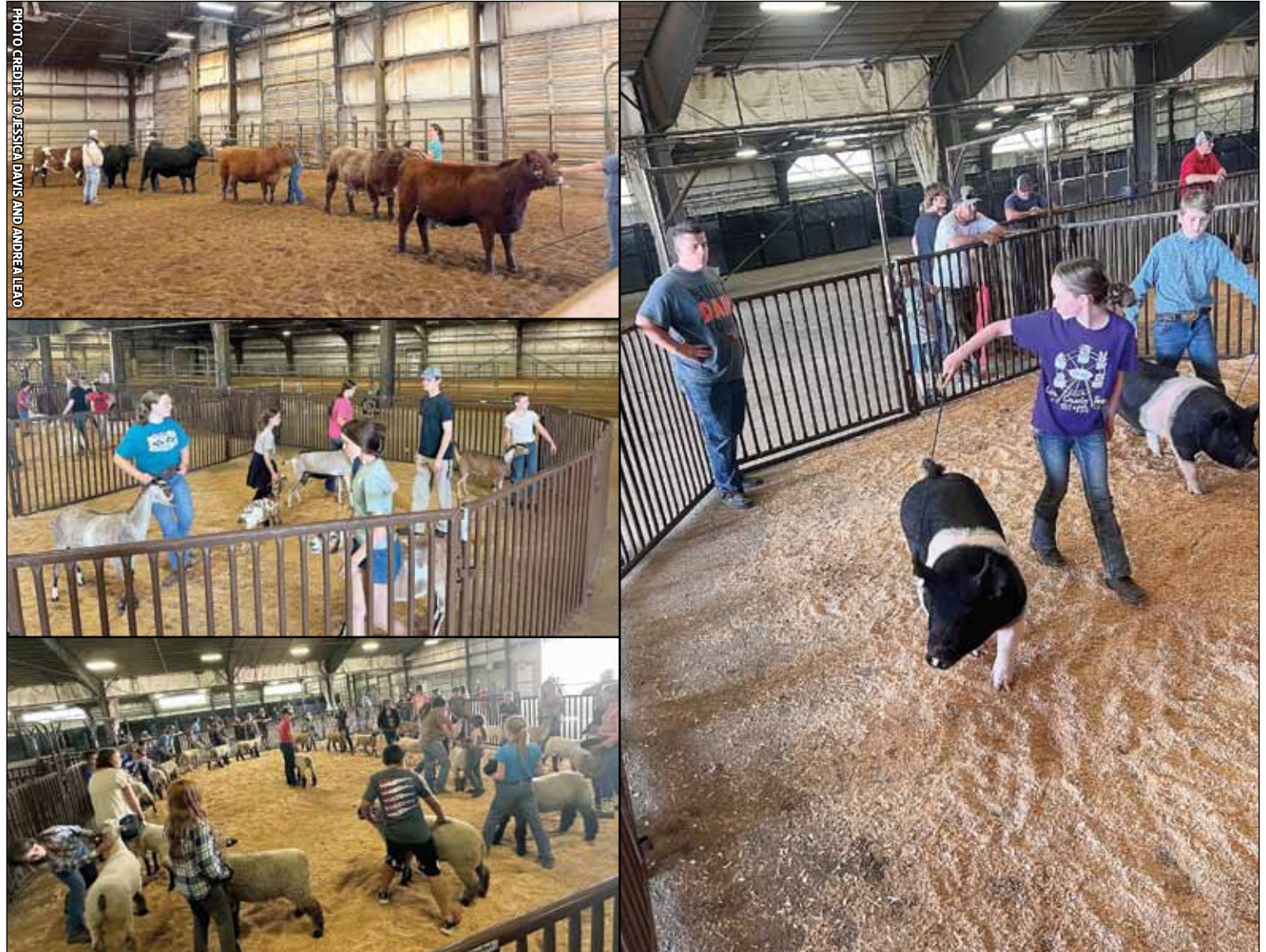
Youth working with their animals and preparing for fair.

Simply put, the lower portion of each market class will be placed with like animals in their species to be sold in a lot of 2 animals. This means that a buyer is purchasing the entire lot at one time. Of course, we are more than happy to split this between two or more buyers. The goal here is to reduce the