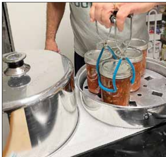
Foods naturally high in acid – most fruits, pickles and salsas – can be processed in a steam canner. Steam canners require less water, but processing time is limited.

I have sung the praises of the domed lid steam canner in previous columns, but I can't say it enough. The time you will save by not water bathing,