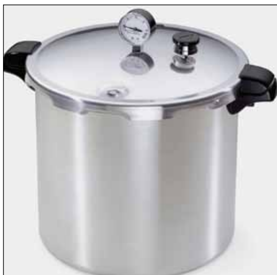
Presto canner with a dial gauge. You can buy a 3-piece weighted gauge set from Presto.com and convert your dial gauge canner to a weighted gauge canner. Weighted gauge canners do not need to be tested.