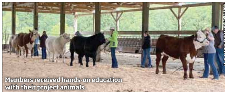
Members received hands-on education with their project animals.

The Benton County 4-H program hosted a Beef Project Clinic on Saturday, June 1, and a Sheep Clinic on Sunday June 23rd where members and their families learned about nutrition & feed, fitting, bio-security, and then were able to learn about and practice their showmanship skills.