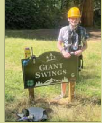
One of the fun activities at camp.