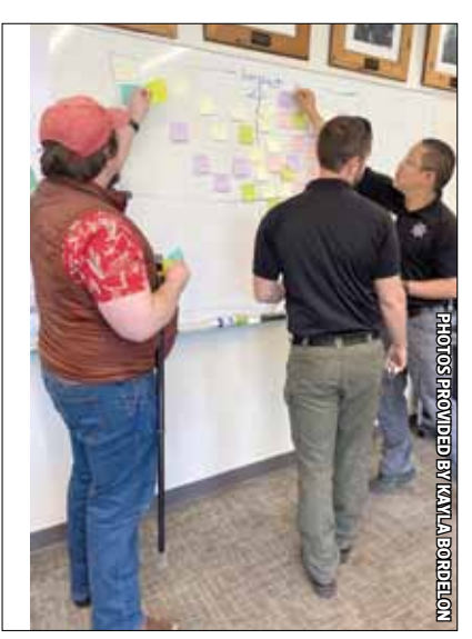
City managers and local officials share community priorities to include in the plan. There were opportunities for one on one discussions to provide insight into local wildfire preparedness concerns and priorities.