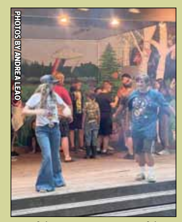
Teaching new songs at skits during Camp Fire.