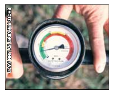
Soil Compaction Probe tool used to see Soil Health.

We cannot easily change soil texture, or the relative proportions of sand, silt, and clay particles, because this characteristic is inherent to the type of soil that exists at a particular location. Instead, we can more effectively work to improve soil structure. One way of improving soil structure is by increasing the amount of soil organic carbon, which comes from decayed organic matter (crop residue and other dead plant material, manure, etc.) within the soil. Several agricultural best management practices can be used to do this such as using conservation tillage, cover crops, leaving crop residue, preventing overgrazing, and precision fertilization. While it may take years, implementing practices such as these increases soil organic carbon, boosts the amount of water soils can hold