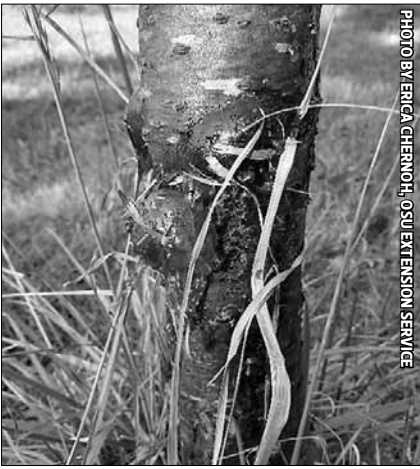
Amber colored gummosis due to bacterial canker on peach tree.

If you grow cherries, it is better to wait to prune until after harvest when the weather is dry, this will prevent the spread of bacterial canker (Pseudomonas syringae pv. syringae). However, winter is a good time to scout the orchard for bacterial canker and flag the branches that need to be removed. It is easier to find cankers and gummosis caused by bacterial canker when there aren't any leaves on the tree. You can prune out the cankered branches now, but be sure to wait for a period when there are