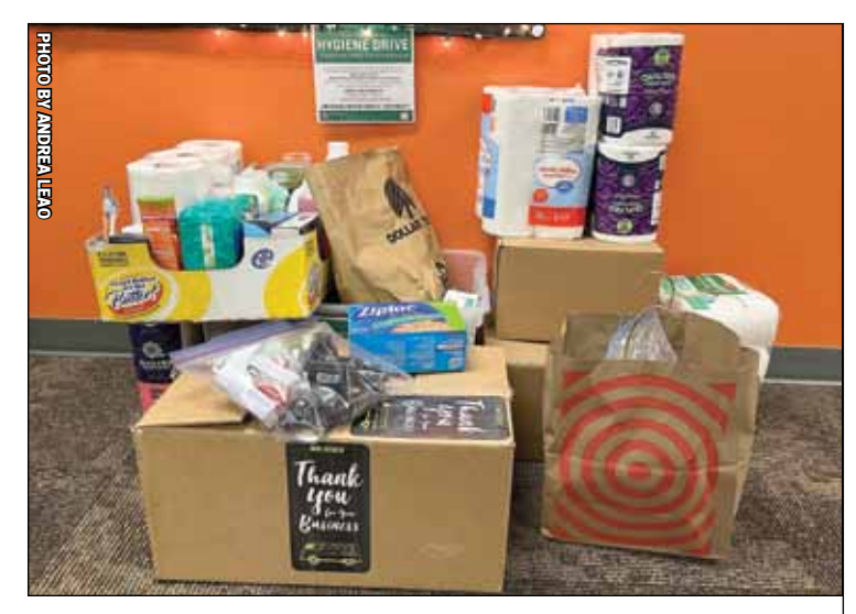
The collection of items donated were brought to Family Tree Relief Nursery on Wednesday, December 13.