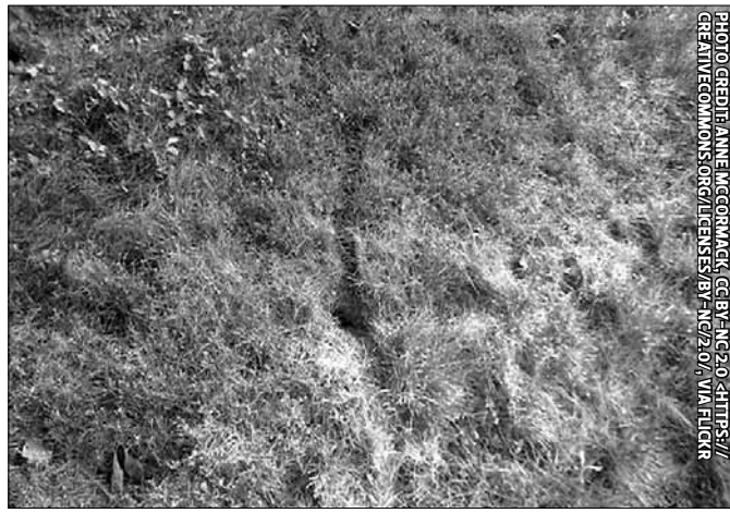
Vole runway and tunnel entrance.

at least 3 days of dry weather in the forecast. Rain splashes can spread the bacterium which is why most commercial growers in Washington have moved to pruning in the summer after harvest, when the weather is dry. To prevent the spread of bacterial canker be sure to sterilize your pruning tools between cuts and burn infected branches.