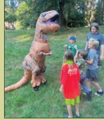
All camp activity with a Dinosaur.