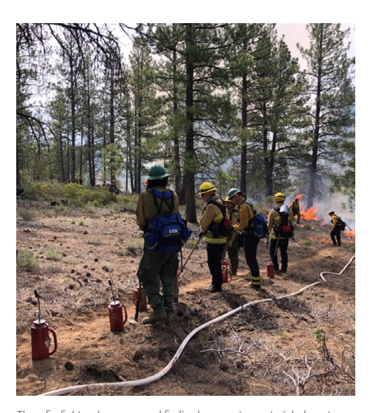
These firefighters have prepared fireline by removing materials down to bare mineral soil. The soil acts as a containment line. Hose lay, charged with water, acts as a supplement to reinforce the line.

Check with the local fire department or the Oregon Department of Forestry when conducting prescribed burn operations.