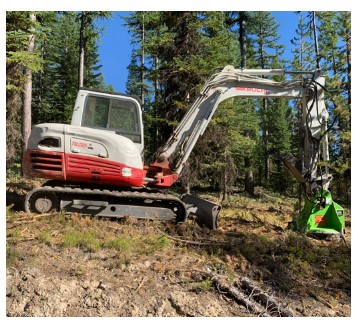
Fuel treatments help moderate fire behavior.