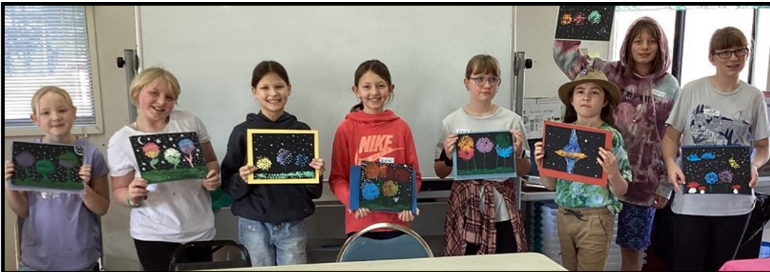
Bubble Art (Above) made by all.