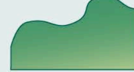
Undulate widely wavy