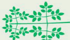
Tripinnate leaflets also bipinnate