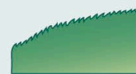
Serrulate with fine serration