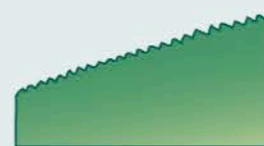
Denticulate with fine dentition