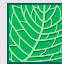
Cross-Venulate small veins connecting secondary veins