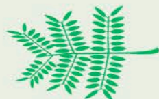
Bipinnate leaflets also pinnate