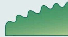
Sinuate with wave-like indentations