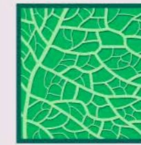
Reticulate smaller veins forming a network