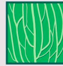
Longitudinal veins aligned mostly along long axis of leaf