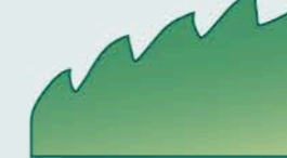
Serrate teeth forward-pointing