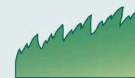
Doubly Serrate serrate with sub-teeth