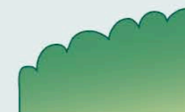
Crenate with rounded teeth