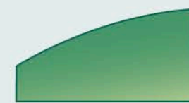
Entire even, smooth throughout