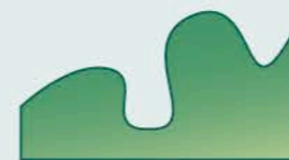
Lobate indented, but not to midline