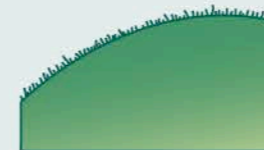
Ciliate with fine hairs