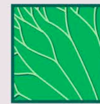
Dichotomous veins branching symmetrically in pairs