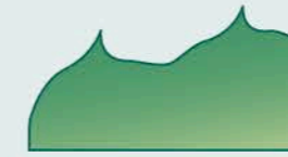
Spiny with sharp stiff points