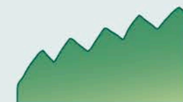
Dentate with symmetrical teeth