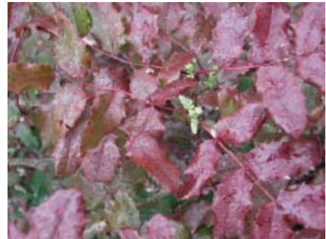
Fall leaf color