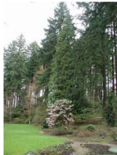
In a garden setting

Tall evergreen conifer, 75-100' in cultivation. Dark green to blue-green foliage with new growth in lighter shades. Deeply furrowed reddish-brown bark. 2-4" hanging cones with distinctive "mouse-tail" bracts.