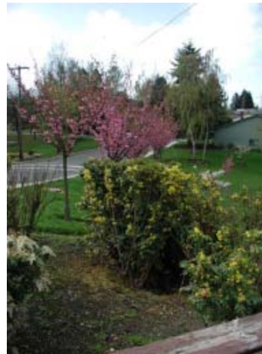
Blooming in a landscape setting

A mid-height, broadleaf evergreen shrub, 8-10' or more. Has spiny, glossy compound leaves with a bronze-copper colored new foliage and clusters of golden-yellow, urn-shaped flowers, that become edible blue fruits. Tall Oregon grape is the state flower of Oregon. Many cultivars, including dwarf forms, are available.