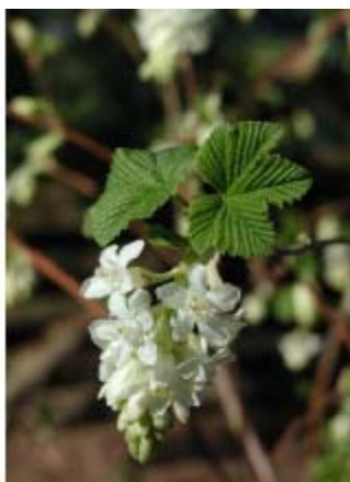
White flowered form