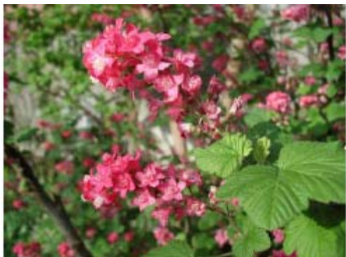
Red flowering currant