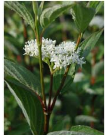
Creek dogwood flowers

A mid-height, deciduous, multitrunked shrub or small tree, 6-16'. Flowers are flat-topped clusters of creamy white, followed by white or bluish berries. Creek dogwood is great for winter interest due to the reddish bark. The size can be controlled by cutting the tallest trunks to the base every 2-4 years. It is a vigorous colonizer. Look for native forms of this widespread species. Drought tolerant/Grows in sun or part shade/Food source for native butterfly caterpillars/ Nectar source for butterflies/Food source, shelter or nesting sites for birds/Nectar source for hummingbirds/Food source for native wildlife or rodents