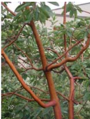
Bark close up