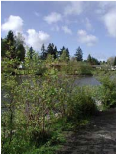
Creek dogwood in a native setting