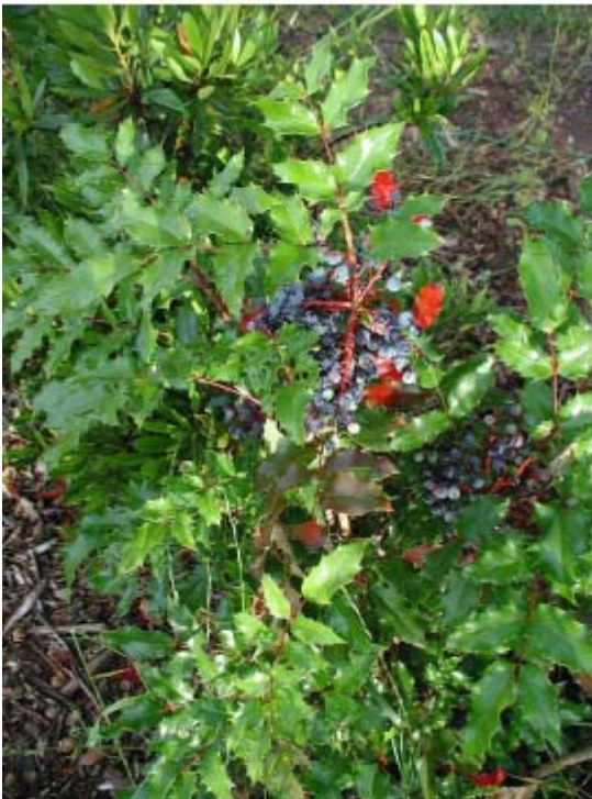
Tall Oregon grape fruits