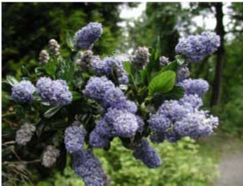
Flower close ups