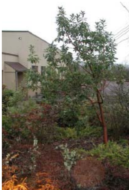
Young Pacific madrone in landscape