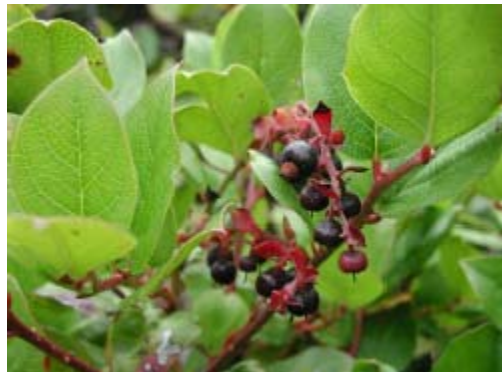
Salal fruits and leaves

Salal is a small, evergreen shrub, 3-5', with lustrous, dark green leaves and pinkish, showy flowers followed by edible purple berries.