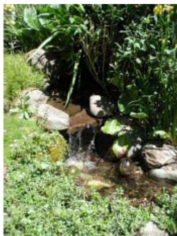
Kinnikinnick as a streamside groundcover

Kinnikinnick is a prostrate, evergreen woody plant with long, trailing branches, 6-8" tall. It has leathery leaves and white or pink urn-shaped flowers followed by reddish-brown berries. Kinnikinnick is one of the finest groundcovers for full sun. It forms creeping mats and is best in well-drained soil. It will tolerate sterile soils, but too much moisture and/or shade can foster fungal diseases.