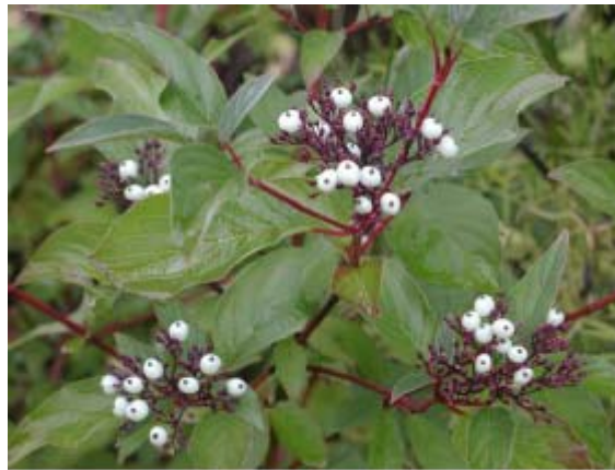
Creek dogwood berries