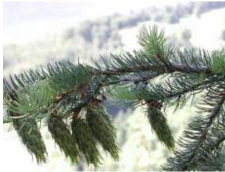
Distinctive cones and bark