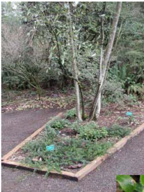
Kinnikinnick in a parking median