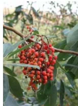
Pacific madrone fruits

A medium broadleaf evergreen tree, 30-75'. The distinctive bark is smooth, thin, reddish-brown and peeling. Produces clusters of white to pink urn-shaped flowers followed by bunches of small, bright orange-red berries.