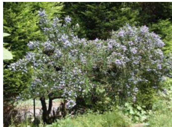
Blueblossom in the landscape

A fast growing evergreen large shrub or small tree, 6-20'. Foliage is fine and lustrous. Flowers are pale blue to deep lilac-blue, blooming in clusters in summer. This species is the hardiest of the wild lilacs, but can be subject to disease if planted in wet spots. Many cultivars are available.