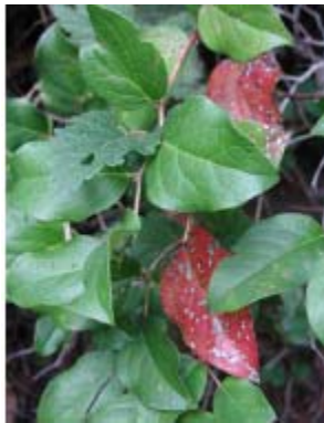
Leaf close up