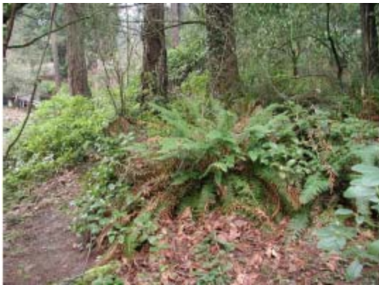
Salal in a native woodland