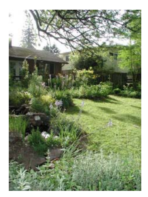
Camas in a landscape