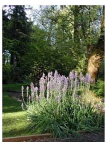
Camas plant habit