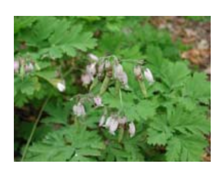
Boothman's variety Bleeding heart