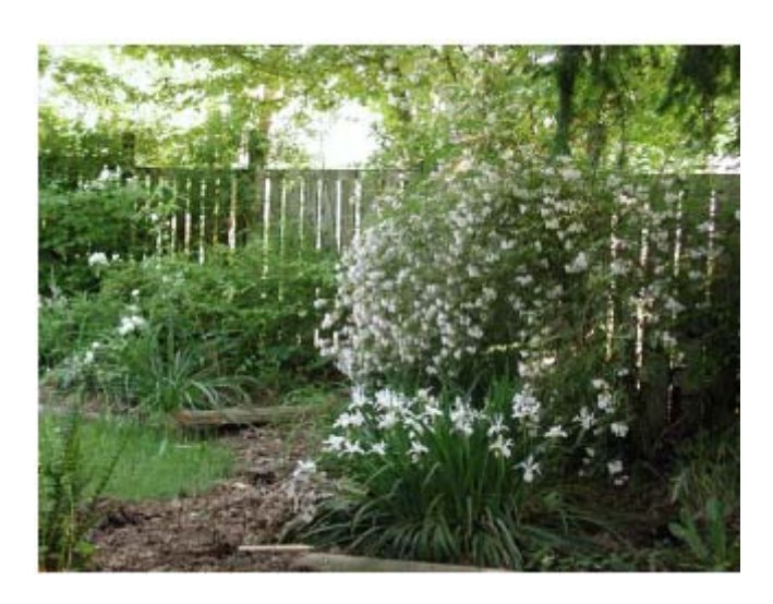
Douglas iris in a garden border