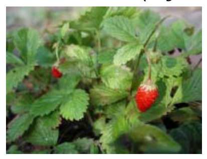
Woods Strawberry (Fragaria vesca)