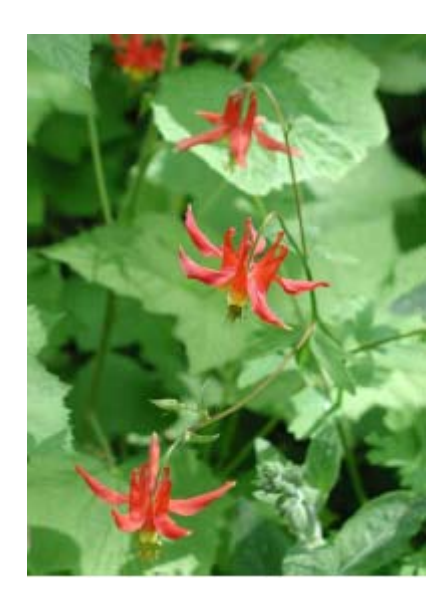
Columbine flowering spike

Western red columbine is an herbaceous perennial to 2-3' tall. It strongly resembles garden columbines, but has smaller red and yellow nodding flowers in the summer. Columbines self seed freely.