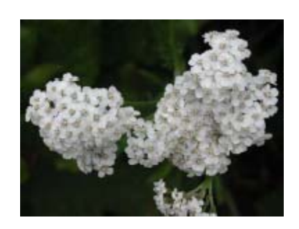
Flower close ups