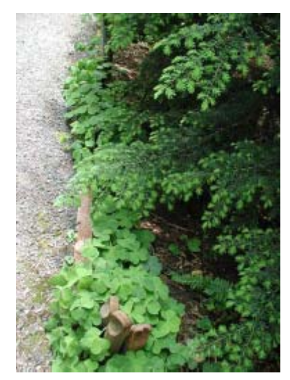
Oregon wood-sorrel as a groundcover