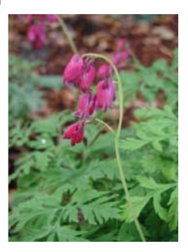
Flower close up