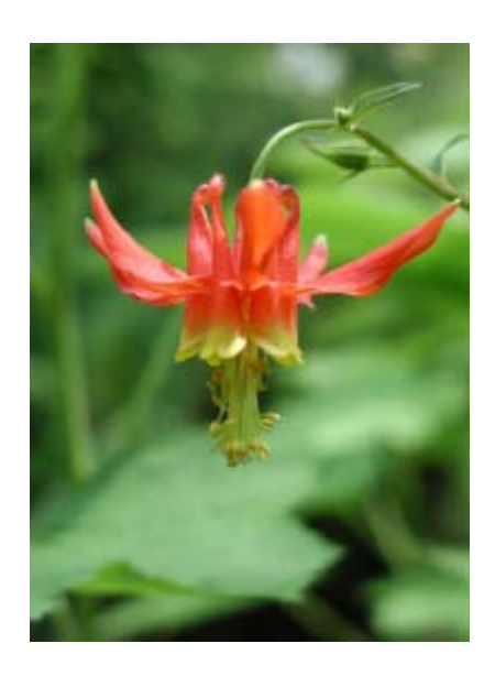
Flower close up