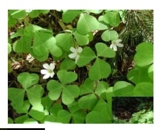
Close up of clover-like foliage and flowers