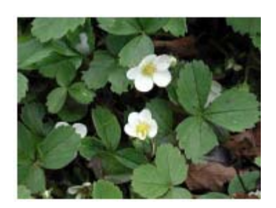
Coastal Strawberry (Fragaria chiloensis)