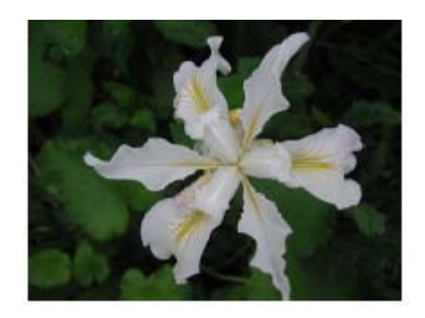
Douglas iris flower close-up