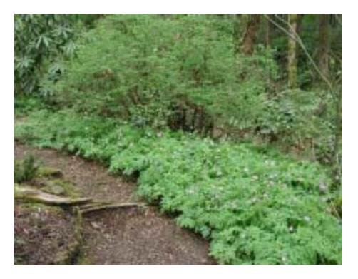
Bleeding heart as a pathway liner

Bleeding heart is an herbaceous perennial to 2'. It has delicate, deeply cut foliage and pendant, jewel-like, pale to dark pink flowers in spring. It goes dormant in fall and winter. Bleeding heart is a valuable garden plant that is best in moist shade, but can spread aggressively. The seed is disseminated by ants. Selected flower and foliage color forms are available.