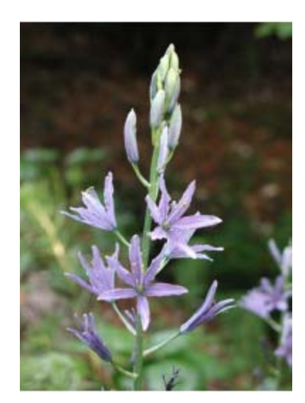
Flower close up

Camas is a stately bulb with 1-3' daffodil-like foliage and blue-violet flowers in spring. The plant goes dormant by the end of summer and self seeds.