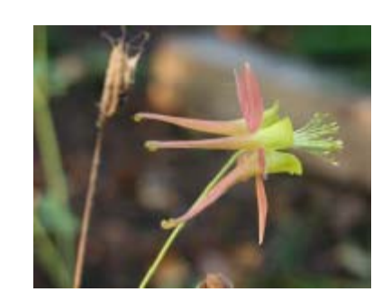
Columbine seed head & flower