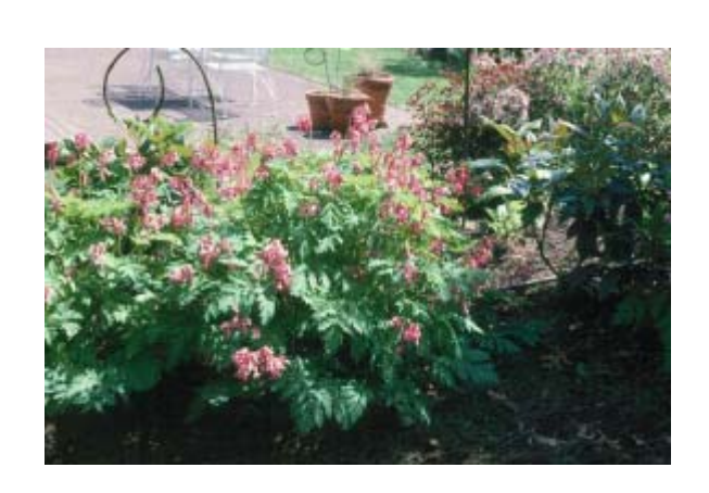
Bleeding heart in a garden setting