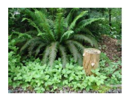
Strawberry as a groundcover in a woodland garden