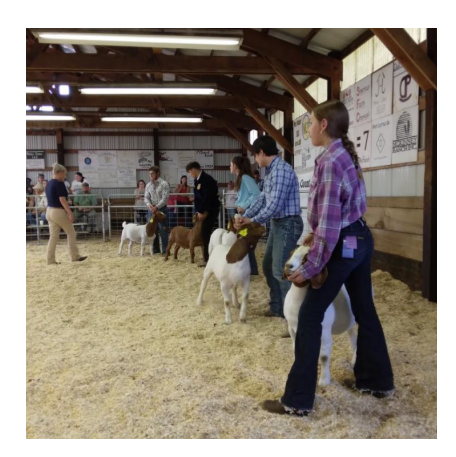
Showmanship photos from the 2022 Sherman County Fair